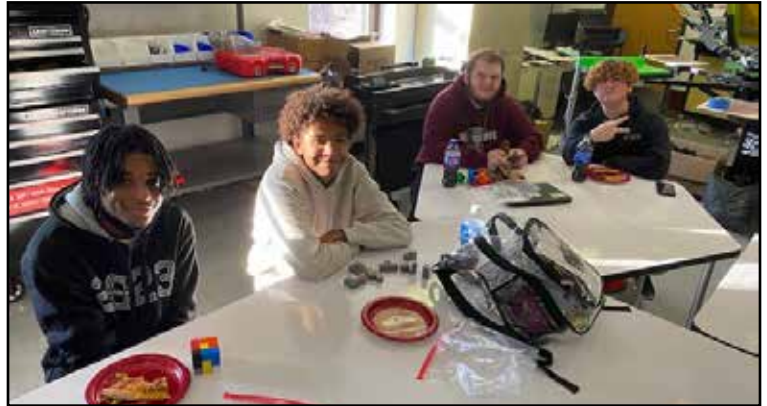
CAD students assembling their soma cube puzzle that was 3D printed: