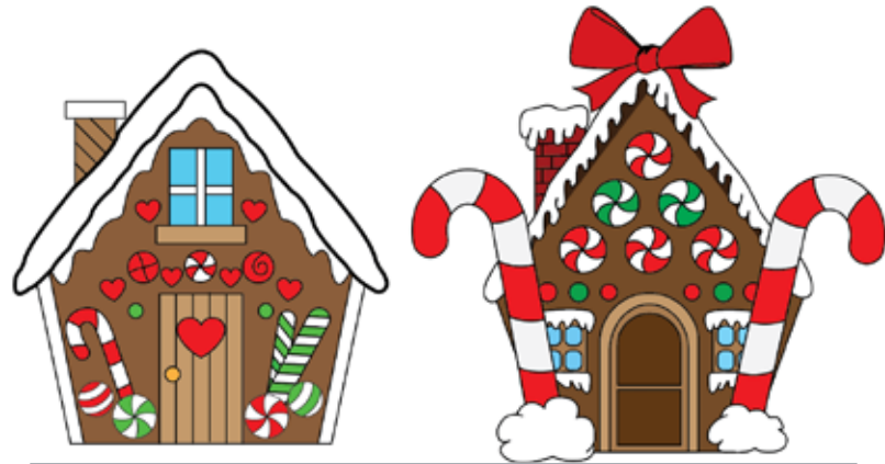
GRAPHIC ARTS: Adobe Illustrator Gingerbread Houses - Miguel Morales